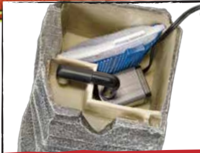
INSTALL FILTER AND PUMP (see included instructions)