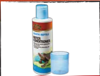
ADD WATER CONDITIONER AS DIRECTED