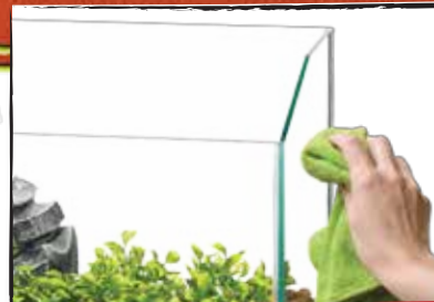
USE A DRY CLOTH TO WIPE DOWN THE OUTSIDE OF THE TERRARIUM