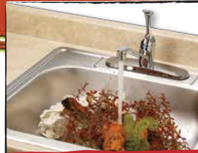
RINSE ALL PLANTS AND DÉCOR