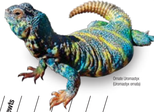
Ormate Uromastyx (Uromastyx ornata)

Choose the right bedding for your reptile.