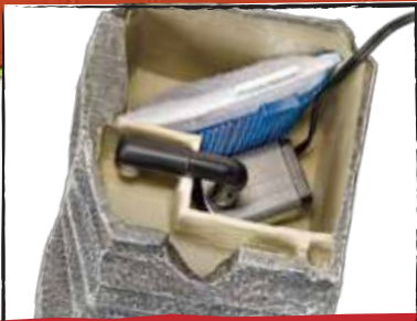
INSTALL FILTER AND PUMP (see included instructions)