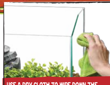
USE A DRY CLOTH TO WIPE DOWN THE OUTSIDE OF THE TERRARIUM