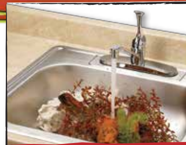
RINSE ALL PLANTS AND DÉCOR