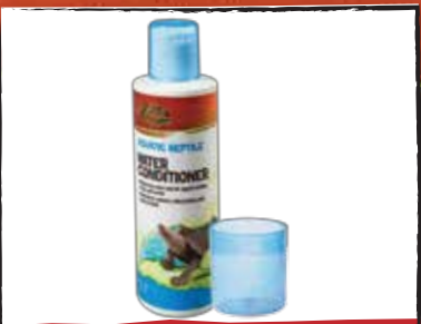
ADD WATER CONDITIONER AS DIRECTED